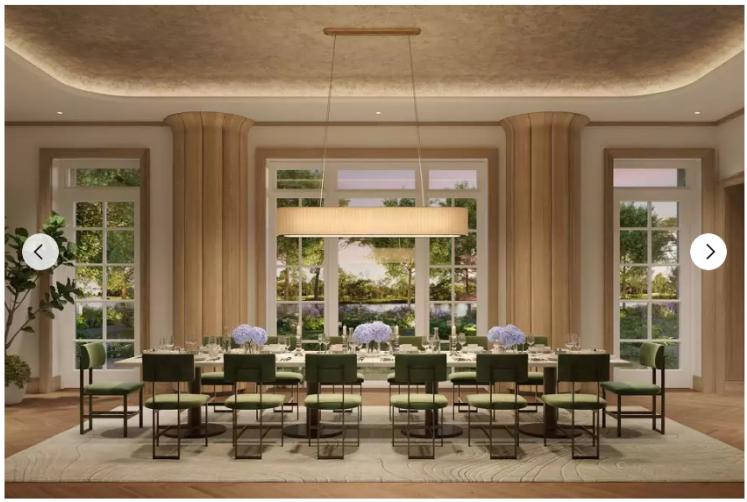
Residents can access this larger dining room space to host dinner parties and other events at the Ritz Carlton Residences, The Woodlands Howard Hughes