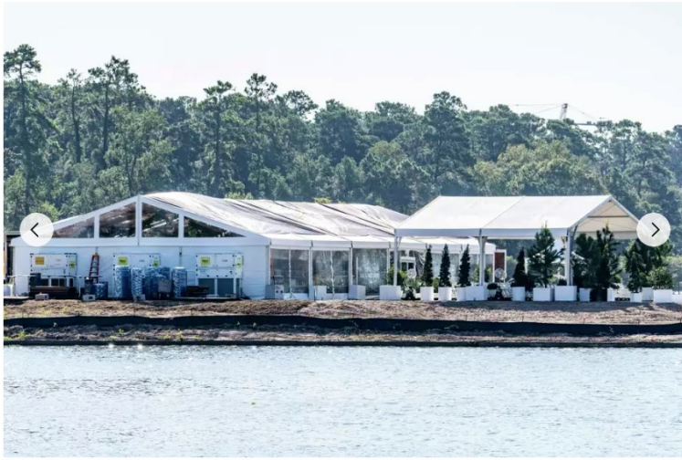
Tent structures are visible on the construction site of the new The Ritz-Carlton Residences, The Woodlands, as the developer prepares for an event Wednesday, Oct. 2, 2024 in The Woodlands.