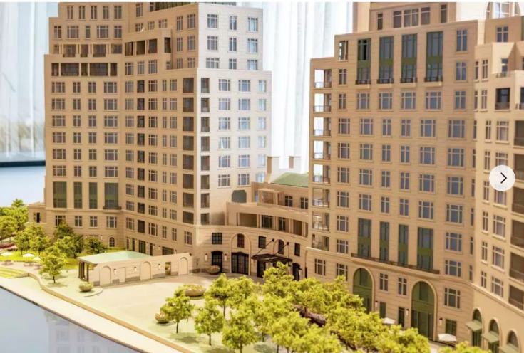
A scale architectural model of the new The Ritz-Carlton Residences, The Woodlands, is on display Wednesday, Oct. 2, 2024 in The Woodlands.