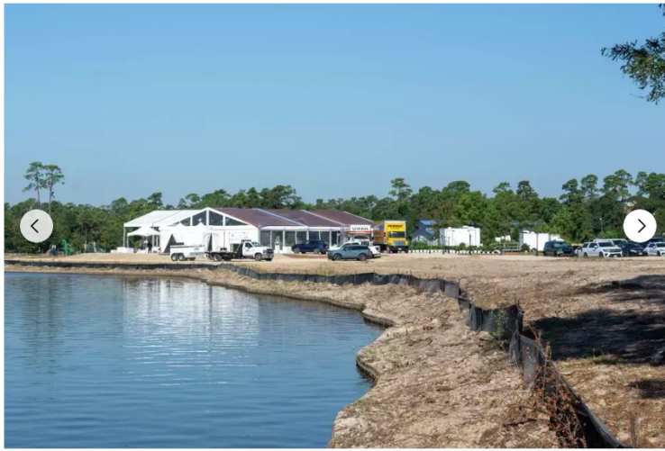
Tent structures are visible on the construction site of the new The Ritz-Carlton Residences, The Woodlands, as the developer prepares for an event Wednesday, Oct. 2, 2024 in The Woodlands.