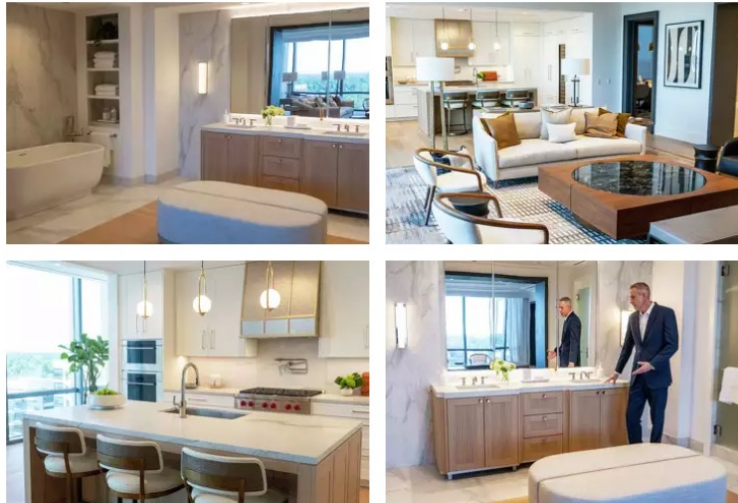
Features such as amenities and finish options available in units at the new The Ritz-Carlton Residences, The Woodlands, are visible in a sales mockup model Wednesday, Oct. 2, 2024 in The Woodlands.

It may seem like an odd time to start construction on a large residential tower, as the real estate market has not fully recovered from the slowdown sparked by higher mortgage rates. Sales of condominiums priced over $1 million in the Houston region are down by about 6% year over year, according to Houston Association of Realtors.