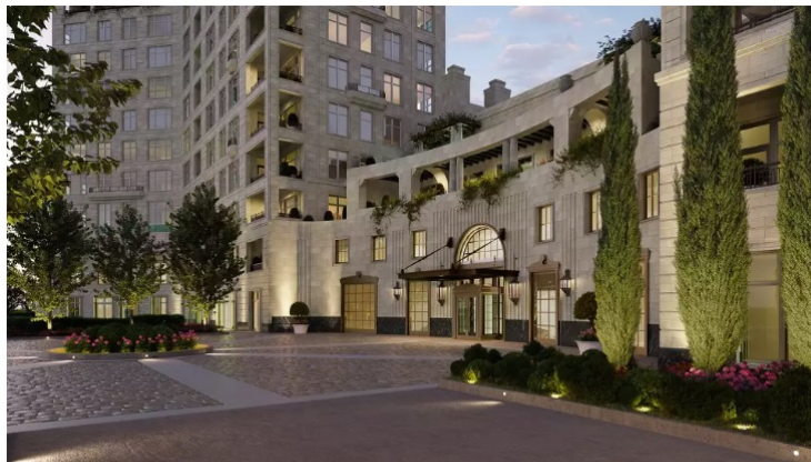
A rendering of the valet entryway at Ritz Carlton Residences, The Woodlands. Howard Hughes

But Howard Hughes leaders said they're tapping into a specific niche: A growing number of empty-nesters in The Woodlands are seeking condominiums, allowing them to downsize from larger estates but remain in the area, Carmen said.