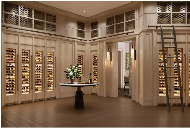
Residents can store their wine collections in this wine cellar depicted in a rendering of the Ritz Carlton Residences, The Woodlands.