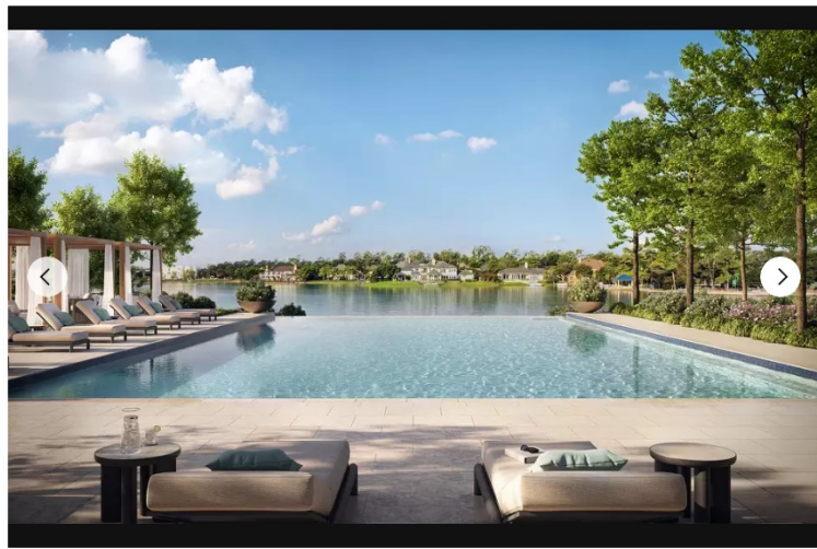
A rendering of the infinity pool overlooking Lake Woodlands at the future Ritz Carlton Residences, The Woodlands. Howard Hughes