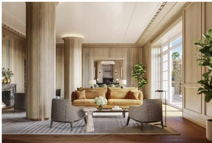
A rendering of some common areas with the Ritz Carlton Residences, The Woodlands. Howard Hughes

The complex includes a 15-story tower and an 11-story tower. Amenities include more than 3 acres of green space; 1,200-feet of lakefront shoreline, an infinity pool overlooking Lake Woodlands; a boathouse where residents can store their kayaks or canoes; flower gardens; and a fitness center with treatment rooms. Plans also call for a 5,000-square-foot restaurant.